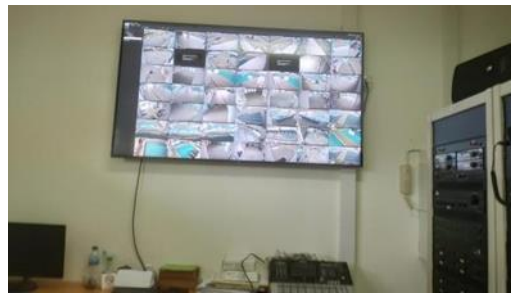
Figure 6. Sports Facility Management Room