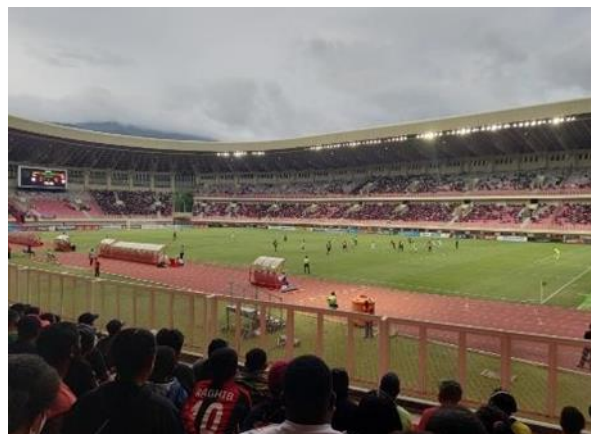
Figure 7. The physical condition of Istora Venue

In Istora Venue, researchers also conducted an assessment with 3 aspects include aspects of feasibility, aspects of infrastructure, and aspects of the performance of sports facility managers. This can answer research questions about the physical condition and also about the utilization of the PON Venue after the 20th PON. The feasibility aspect during observation on August 6, 2022, for the physical condition of the Istora Venue continues to be well utilized such as the Tanah Papua Symphony but the condition criteria are in "Good" with a condition index of 70-84. In addition, Istora has a stretch of steel dome along 80 meters, and the grandest in Indonesia. It has a building area of 7,740 square meters for the suitability of the physical standards of the building at Istora according to leads such as Istora Senayan includes a building structure that starts in length, width, and height, the building also available several rooms that support.