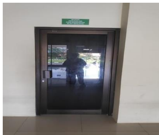
Figure 11. Lukas Enembe Shooting Arena Infrastructure Facilities

Aspects of Infrastructure Facilities When observed on August 3, 2022. For the feasibility of the Shooting Arena Venue, it is still classified as good with a condition index of 70-84. facilities and infrastructure are still very complete for the Shooting Arena Venue starting from various rooms and shooting equipment such as weapons and bullets that are still stored in the weapon storage room.