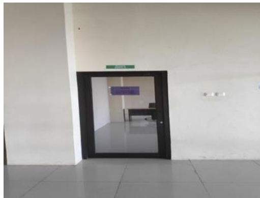
Figure 12: Performance of Sports Facility Managers