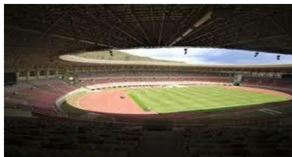
Figure 1. The physical condition of Lukas Enembe Stadium

Based on the results of observations for the assessment system at the Lukas Enembe Main Stadium, it is divided into 3 aspects which are assessed, namely aspects of feasibility, aspects of infrastructure and aspects of the performance of sports facility managers. It aims to answer research questions regarding physical conditions and also about the utilization of PON Venues after the 20th PON in Papua Province. Based on aspects of feasibility When observed on August 8, 2022, the physical condition of Lukas Enembe Stadium continues to be well utilized such as the existence of league II but the condition criteria are in "Good" with a condition index of 70-84.