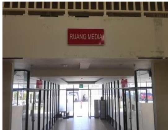
Figure 10. Lukas Enembe Shooting Arena

Aspects of Infrastructure Facilities When observed on August 3, 2022. For the feasibility of the Shooting Arena Venue, it is still classified as good with a condition index of 70-84. facilities and infrastructure are still very complete for the Shooting Arena Venue starting from various rooms and shooting equipment such as weapons and bullets that are still stored in the weapon storage room.