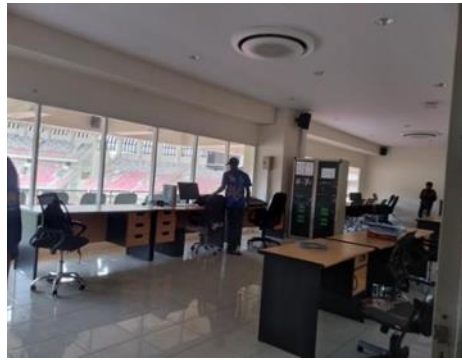
Figure 2. Lukas Enembe Stadium Infrastructure Facilities

Based on the performance aspect of sports facility managers, when observed on August 8, 2022, based on security regarding the guarding of sports facilities, there are field technicians (electrical and mechanical) who always check sports facilities.