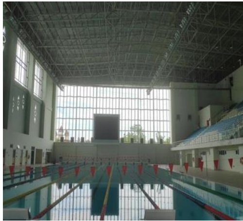
Figure 4. Physical Building of Aquatic Venue

Based on aspects of infrastructure facilities during observations on August 9, 2022. For Aquatic Venue Facilities and infrastructure such as tools and chemicals that function as water maintenance in the Aquatic Venue pool. The condition of the infrastructure is still very good this is because it is still considered by the technicians of the field members. For good assessment criteria based on the condition index with a value of 70-84.