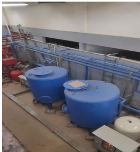
Figure 5. Aquatic Venue Infrastructure Facilities

Based on aspects of infrastructure facilities during observations on August 9, 2022. For Aquatic Venue Facilities and infrastructure such as tools and chemicals that function as water maintenance in the Aquatic Venue pool. The condition of the infrastructure is still very good this is because it is still considered by the technicians of the field members. For good assessment criteria based on the condition index with a value of 70-84.