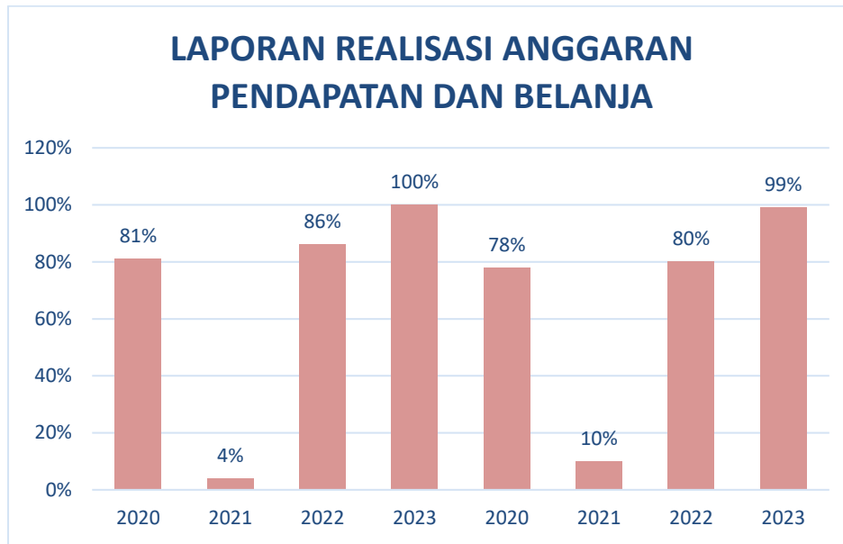
Figure 1. Diagram of the Gorontalo Provincial Government Budget Realization Report for 2020-2023

(Source: Gorontalo Provincial Finance Agency in 2024)